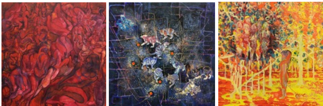
Figure 3: Illustrative 'works in progress' synthesised from Group One interviews using arts based methods - Participant M (far left) experienced anxiety from unresolved past personal issues, noting she could not 'turn my thoughts off'; Participant L (middle) spoke about sifting and sorting (literally and metaphorically), spending time with her cats and driving people around in cars; Participant C (far right) spoke about simply getting outside, looking up at the sky rather than down at her phone. Each work is Oil on Canvas 40 x 40cm.