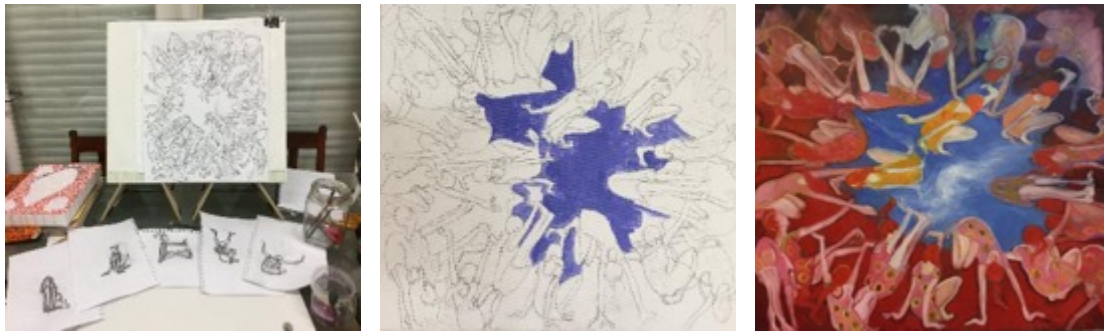
Figure 2: Work in Progress—field notes/sketches, stages for critical feedback, emergent artwork, acrylic and pencil on paper, reflecting feelings of feeling buried under stuff; moving; breaking out/through expressed by participant L, Lisa Paris 2018.

The researcher inductively explored participant data through multiple readings (Figure 1). The first creative work based on key words and phrases summarised feelings for the DS experience and was interpreted as a concept sketch (Figure 2 far left) shown to participants to start the next interview. This conversation started with an explanation of the sketch (Figure 2) and the inductive analysis of the last interview. The participant had the opportunity to engage in dialogue, to confirm/amend the visual interpretation and to suggest modifications to the work. The sketch and accompanying dialogue became a triangulation and member checking process, where the research material was reviewed to ensure its credibility (Janesick, 2000). This process continued throughout the DS experience, supplemented by participant source materials (images/written journals) that provided additional information to support interview materials and inspire new works (Figure 3).