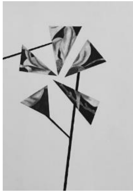
Figure 6: Example of CR's own practice - Magnolia , 2017, charcoal and pencil on paper, 42x29cm.

The researchers' challenge in this project was to interpret key content and narrative (Figure 5) faithfully/authentically into creative works (Figure 4). Each researcher had a well-established visual practice but recalibrated their preferred past ways of working to devise a new approach aligned to the 'voice of participants' as the focus of the work.