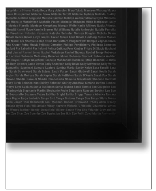
Figure 3. Anonymity poster (left) and detail (right) listing the name of every women who have won or served on the jury of the AGDA Awards.