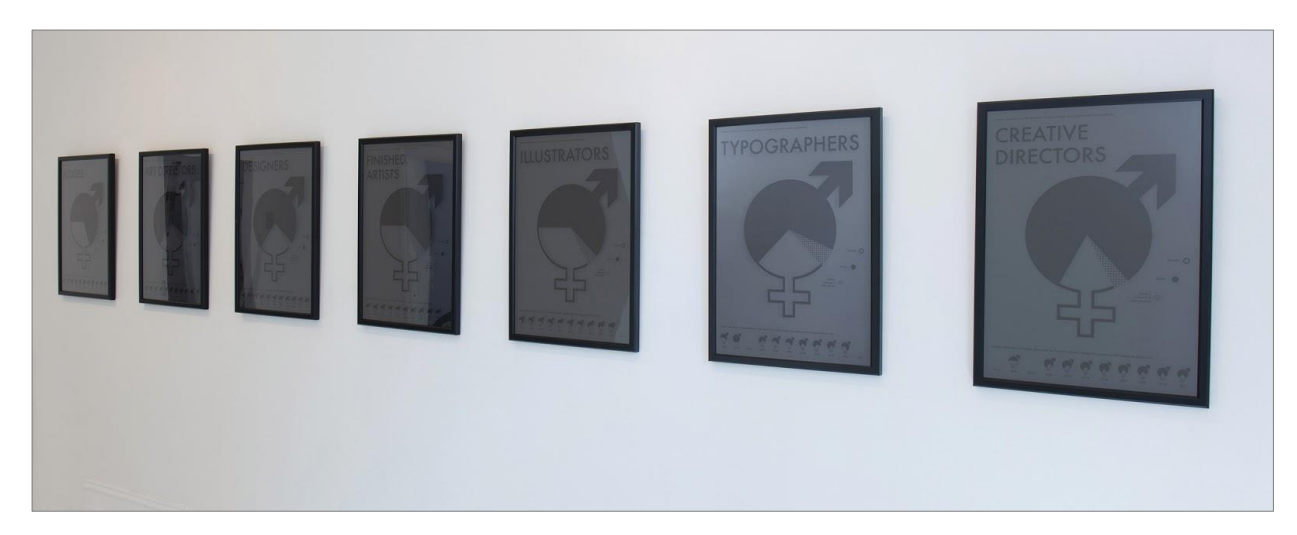
Figure 1. Anonymity Poster Exhibition, created to measure the visibility of women in the AGDA Awards.

This paper will discuss insights gained while creating the Anonymity Poster Exhibition [Figure 1] – a visual means to measure and evaluate the visibility of women in the Australian graphic design industry through their presence in the AGDA Awards (originally the Australian Graphic Design Association). Within this article I argue that award processes can work towards gender equitable visibility in the design industry.