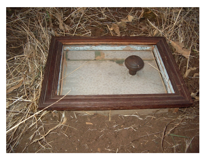
Fig. 8: earth drawers, 2012, outstallation, recycled timber, picture frame, door handle, dimensions variable, Palmer Sculpture Scape, SA

The things that constitute my art works have a peculiar material quality, as does the space they occupy. They demonstrate how even weather-beaten material salvaged from a shady edge of the driest continent on earth are intensities, investments in time and provisions to share, open to the possibility that worth can be celebrated through symbolic play (Bryson 1990, 23). In combination they can be described as descriptive of the field in fluid definition as analogous to Bernard Cache's phrase and artefact title (fig.15) 'from city to teaspoon' (Cache 1995, 70). The artefacts then become part of a scene, enabled to appear as not more than they are, but precisely as they are. My role is to magnify and intensify their presence, or 'collective agency' simply through placement (Bennett 2010, 98). Their loose moorings re-affirm my pivotal role as artist and player within a network of things rather than a maker of site-specific or ephemeral art (Kwon 2014, 157).