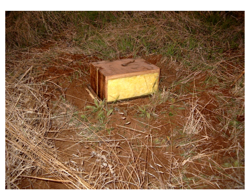
Fig. 1: soap box from (earth drawers) series, 2012, outstallation, recycled timber and washing soap, dimensions variable, Palmer Sculpture Scape, SA

This paper is a script in defence of a virtual space of artistic practice with a view to extending the normal coordinates of perception and exchange relations. I am concerned with how art is made (and how it functions in a field of relations) to show what my art practice can do to cultivate and expand the connection between art and an ecological sensibility. I would describe my studio process as a seamless interplay and continuum of making and thinking that encapsulates the will to go beyond typical and habitual modes of thought.