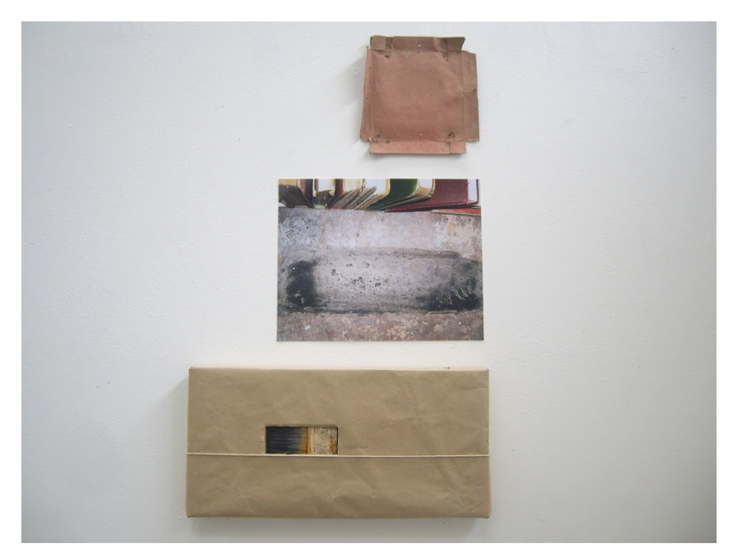
Fig. 12: gifted , 2011, brown paper, string, house paintbrush, 18 x 28 cm + photograph and card, Liverpool Street Gallery, University of South Australia

To explain, my art practice is an offering that sits somewhere between rational thought and unconscious imagination. As Hyde writes,