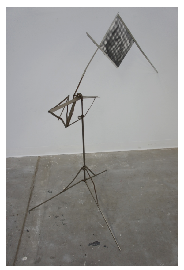
Fig. 9: I AM , installation, music stand circa 1940, photocopy on reclaimed music paper and folder rims, Liverpool Street Gallery, UniSA