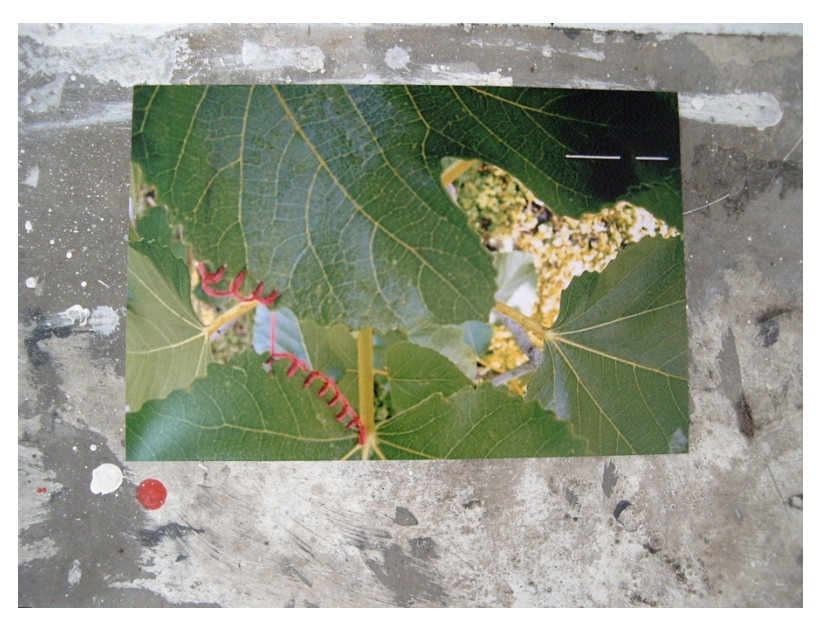
Fig. 5: blanket/ directed field, 2011, digital photograph of sewn leaves, approx. 40 X 60cm, Liverpool Street Gallery floor, UniSA, Adelaide

and located within a social interstice (rather than primarily answering to the laws of fiscal currency and bilateral return) it can also be said that this expansive and associative capability is the proper terrain of philosophy. This capacity can be traced to the readymades of conceptual artist Marcel Duchamp and is central to Stengers' notion of agency, Guattari's concept of the Anthropocene and Hyde's commerce of the creative spirit. These philosophical and theoretical positions are imbedded in my making process in order to situate my art practice within the field of ecological politics and place me, as an artist, in a position of accountability.