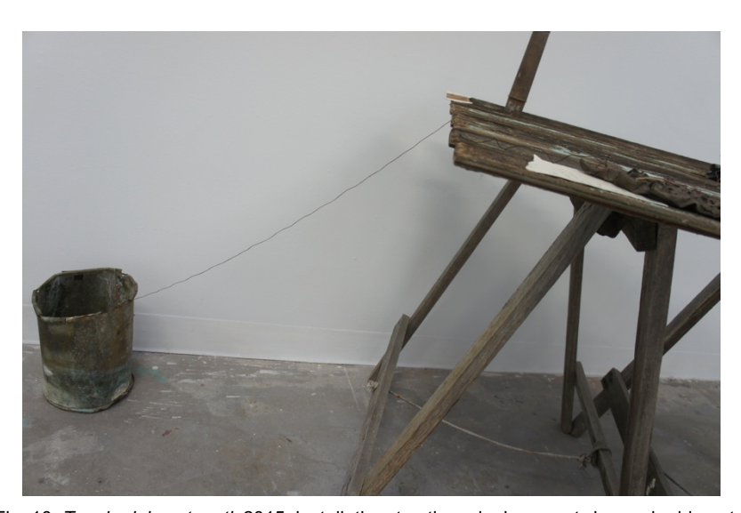
Fig. 10: Tavola dei contenuti , 2015, installation, trestles, planks, can, twine and oddments, dimensions variable, Liverpool Street Gallery, UniSA

This brings me back to the central idea that emerges from the overlappings and resonances between Stengers' notion of agency, Guattari's 'common principle' and Hyde's attention to the natural, spiritual and social aspects of the gift (Hyde 2009,194). The practice of gift exchange, like art, occupies a transitory realm and can be described as a conscious practice