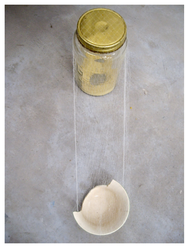
Fig. 7: plexus , 2012, digital reproductions of preserving jar, pollen, cup and hair net, dimensions variable, Liverpool Street Gallery, University of South Australia

I deal mostly with quite small objects, commonplace things often considered to be of little importance or value, yet my contemplation of these is conducted at a deep level. Such trifles lack uprightness and the prestige of the virtuous and ideal human subject (Smith 2011). What I am doing is attending to things that have otherwise been disregarded and 'overlooked'. I consider them as a form of commentary defining a particular locality that has been observed intensely.