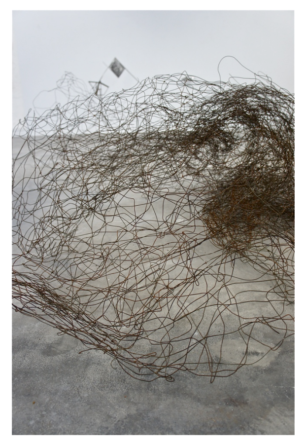
Fig.13: song of myself , 2015, installation, rusty farm wire, dimensions variable, Liverpool Street Gallery, UniSA.

The idea that aesthetics plays an integral role in art's visibility ties in with Guattari's particular emphasis on the quality of subjectivity, where the interface between both private and public realms and the pathway between the artist and viewer become paramount. Aesthetics activates a range of sensoria through intensive, productive and discretionary modes of exchange. Without aesthetics art has no meaning and without exchange art has no affect. What is important for Guattari is establishing through observation what binds these worlds together. This is what he terms the 'common principle' (Genosko 2010,104).