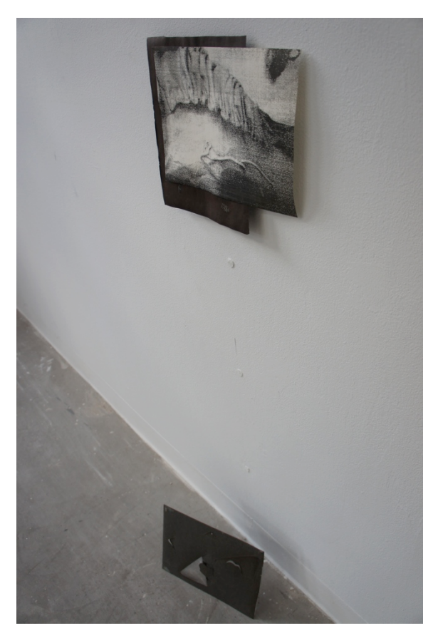
Fig. 3: of cabbages and Kings, 2015, digital photograph of leaves and rubber bands photocopied onto aged paper with dismantled photograph mat,approx. 20 x 28 cm, Liverpool Street Gallery, UniSA

systems of the mind (Bateson 1972, 464). Accordingly, I have adopted a process in which 'consciousness and intelligence open up the material world to the play of virtuality' (Grosz 2004, 230), and where the virtual may be accessed through praxis. This strategy does not insist on the certain knowledge of scientific method nor does it privilege the faculty of thought instead it demonstrates that 'learning is, after all, an infinite task' (Deleuze 2004,166).