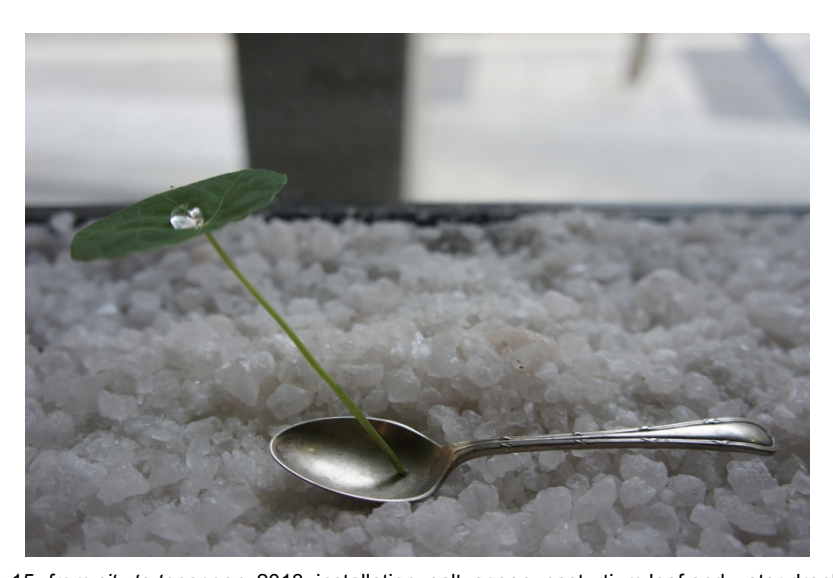
Fig.15: from city to teaspoon, 2013, installation, salt, spoon, nasturtium leaf and water droplet, 22 x 200 cm, SASA Gallery window, UniSA

I remain deeply curious about the aesthetic function of art and its role within this network of relations. My art works are deviations, 'patternations' and 'monuments of duration' that are not I would assert, representations but resonances, interrogations and points of resistance. In this manner they are not intended as mappings but as an itinerary, 'a fragmentary sequence of events and actions through spaces, that is, a nomadic narrative whose path is articulated by the passage of the artist', (Kwon 2004, 95) and where art and aesthetics take up a place of intrinsic value as meters of survival.