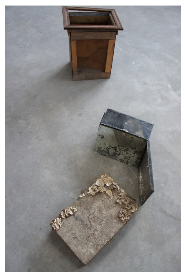
Fig. 2: mirror , mirror , 2015, Installation, picture frame, mirror, lichen, brick, steel and timber boxes, dimensions variable, Liverpool Street Gallery, UniSA

assembled objects and installations are vehicles that intimate knowledge in a manner that brings an array of possibilities and multiple potential meanings to my topic (Scrivener 2001,para 22) whilst embracing active experimentation as a fundamental, philosophical and political gesture. This whole project is reflective of my own anxiety about the futility and wastefulness of conventional art production, a preoccupation synonymous with early conceptualism, feminist theory and eco-feminism (Plumwood 1993, 60).