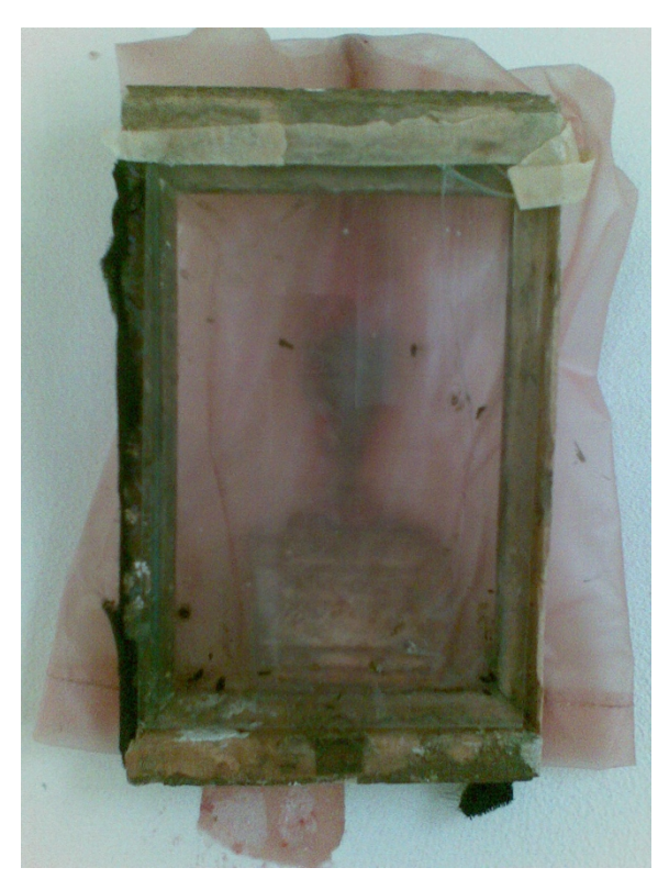
Fig. 6: un-becoming , house paintbrush, 2013, 1950s plastic and frame, 10 x12 cm, Seedling Art Space Belair, SA

the extent that the materials I use and the manner in which they are applied are chosen with a conventional approach to ecological sustainability in mind and according to the terms of a subsistent practice. The way I select out things that are generally relegated to the scrapheap situates my practice within a contemporary setting where the imperative relevance of art can be found by coming to terms with a cultural inheritance. It is in this manner and through this process that my art works retain an unbecoming quality of things chosen for their state of repair and inflections of time.