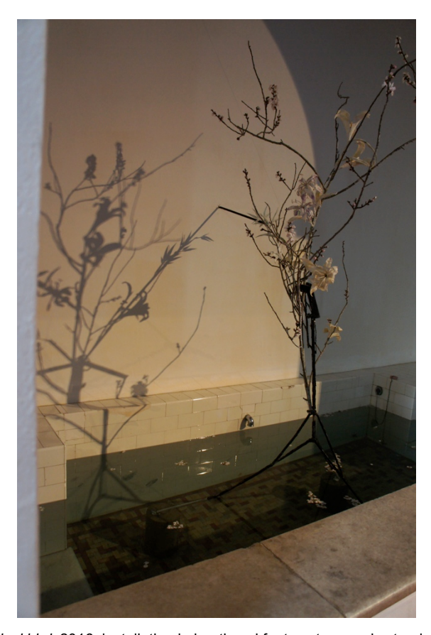
Fig.14: blackbird , 2016, installation in baptismal font, water, music stand, charcoal, flour, flowers and branches, dimensions variable, Prospect Gallery, Adelaide.

Furthermore, Hyde writes, 'a work of art itself however is not necessarily a gift but instead it is what we make of it' (Hyde 2009,xvii). It is through 'a sympathetic perception of objects [that I am able to enact] a remembrance of the wholeness of things' (Hyde 2009, 227) by emphasising the value of 'value-less-ness'. This ties in with Guattari's philosophy where he emphasises the value of subjectivity. It is here that the experience of observation brings the material world and 'real' world together in conversation with the imagined world (Ikas&Wagner 2009, 50-51) and where the gap between an object and our experience of it becomes known to us. The relationship between these two forces is the distance between things, reminiscent of what Deleuze and Guattari refer to as intensive space and 'unjointed time' (Rajchman 2000, 136-137). These positions point towards the existence of a delicately intricate world that sits behind the present.