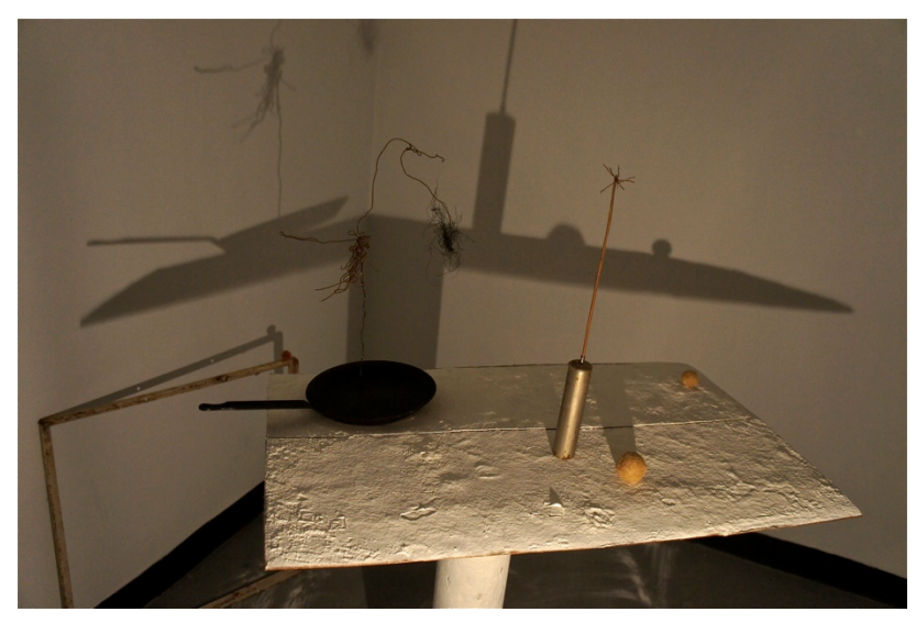
Fig. 11: cosmograms on the commons, 2015, installation, fuse wire, frying pan, seed pods, egg white, flour, steel frame and galvanized pipe, dimensions variable, Liverpool Street audio visual room, University of South Australia

that restores to experience the associative dynamism of things. As Hyde writes, '...the reception of objects reveals that the gifted self is a thing that breathes' (Hyde 2009, 284). To attend to the idea that lively forces are immanent to all 'things' is, 'to encourage more intelligent and sustainable engagement with vibrant matter' (Bennett 2010, viii). It is to bear witness to the base materiality of the world by consideration of the weight and intrinsic worth of all things. It is not about bounded symmetry - a bespoke frame, but framing as the binding thread of material relations.