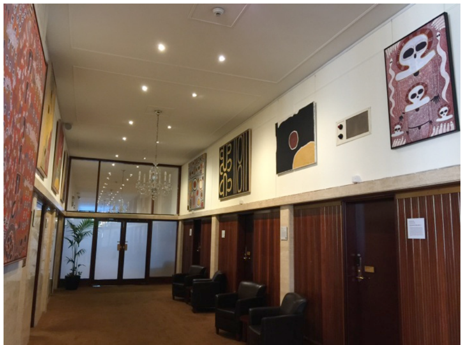
Figure 1: ECU Curatorial Project Parliament House, 2016.

The cultural impact and significance of this engagement was not realised until the evening of the official opening, which was attended by a large number of Aboriginal elders from remote communities in the north west of Australia. Coincidentally, the opening fell on the same evening as the late sitting to debate the intended closure of 150 remote communities, a contentious situation made public by the now famous speech by the then Prime Minister Tony Abbott in which he referred to the situation of these communities as being a result of