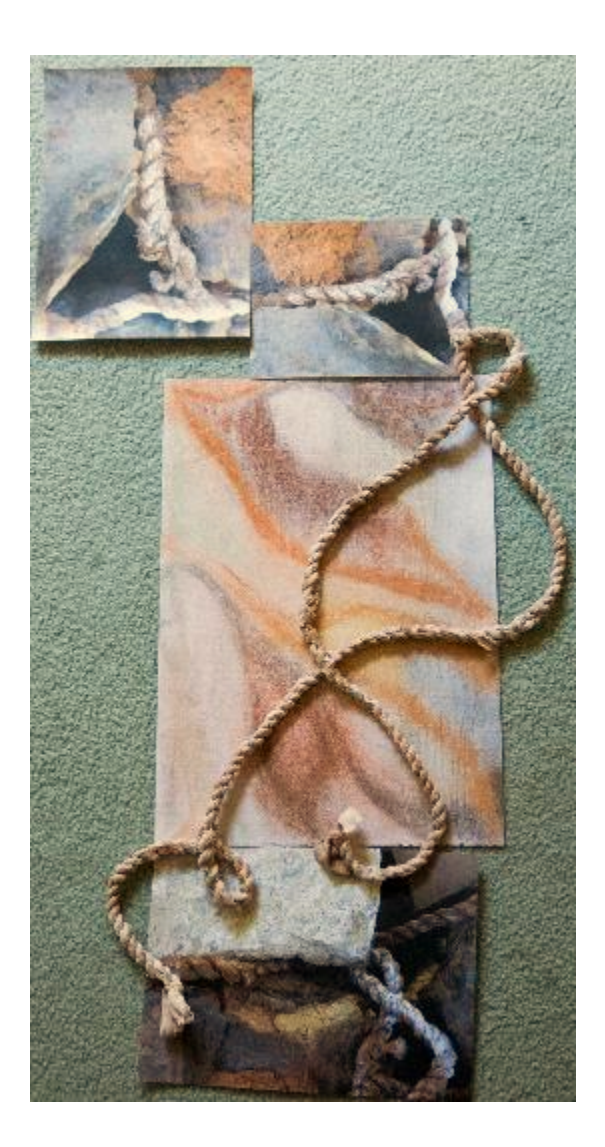
Figure 2: Annette Nykiel, 2015, Untitled (7573) , image of an ephemeral bricolage

As a bricoleur, I practice an "improvisational" approach making use of ideas, methods and materials at hand (De Freitas, 2011) informed by experiential and haptic observation in situ (Nykiel, 2014). Untitled (7573) (Figure 2) is a bricolage of existing media and methods, at hand, innovatively creating new forms and new meanings.