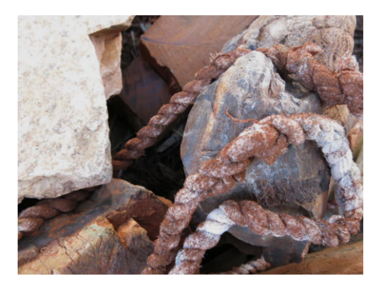
Figure 4: Annette Nykiel, 2015, Bound to the Country (7417) , image of installation courtesy of the artist

Attachment to the Country, for me, is about a visceral, sacred need, visualised in Bound to the Country (Figure 4), for example. An image from an ephemeral installation of mineral samples (probably bearing traces of blood and sweat) and string (sweat and tears), hand plied from the rags used to clean a place where I had stayed; a place with a long colonial history but with a different significance for me. It is my personal reconciliation with the Country, a sense of belonging, a sense of place, an attachment that is informed but not defined, by my Indigenist ontology and axiology, but more importantly, by time spent and the experiences of a keen, haptic observer and slow, embodied maker. This forms part of my identity.