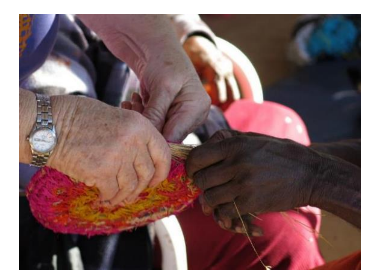
Figure 5: Annette Nykiel, 2015, Quietly Making (8201), digital image

However, there are artists meeting and collaborating less hung up on labels, politics and "-isms". Instead, they are conversing with signs, symbols, language and shared time in the Country to yarn and to materialise their feelings and a shared connection to the Country as Quietly Making (Figure 5) documents. Makers, who are beginning to converge in a place, are without expectations of exploitation and romanticism but with a real intention of engagement (Izett, 2005, Radok, 2012, Rey, 2014). At this cultural convergence, this meeting place, artists are quietly and slowly making placebased art with aesthetic value and dare I say beauty while critics, and indeed academics, take sides and draw battlelines before retreating to the bunkers of political correctness (Angel, 2012). People are sitting down (often derrieres on the dirt) in the Country, having real space, real time conversations with makers, materials and the place. Erica Izett (2005) describes this as 'more than aesthetic tribute... [it is] ...embedding a complex new awareness of country [ sic ] within ... [creative] practices'; a quiet making.