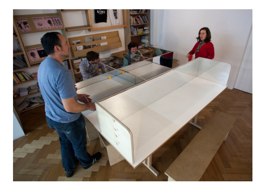
Figure 3: Transpositions – A Proposition for the 21<sup>st</sup> Century Library in the Reading Room of West Space gallery, Melbourne, 2014.

a passive observer due to being implicated in the work and consequently embedded within it. If the contradictory feedback from the clinical mirror box causes a crisis in representation and forces active changes in neuronal activity in the brain, we can also surmise that neural changes occur in the perception and consequent cognition of this work.