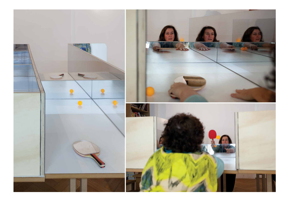
Figure 4: Playing table tennis in Transpositions – A Proposition for the 21<sup>st</sup> Century Library in the Reading Room of West Space gallery, Melbourne, 2014.