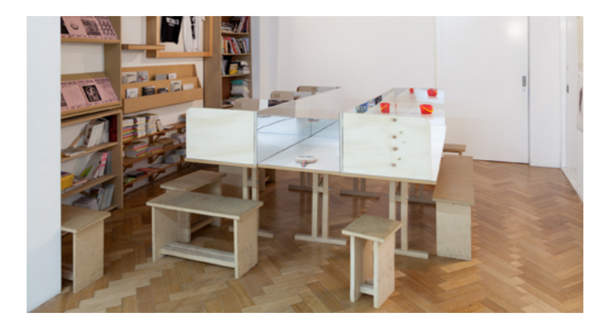
Figure 2: Transpositions – A Proposition for the 21<sup>st</sup> Century Library in the Reading Room of West Space gallery, Melbourne, 2014.

As sculptural objects, these works create stimulating and unusual spatial relationships. The mirrored surfaces enhance perception and create expanded fields of vision as well as providing visual feedback concerning participants' bodies and actions. The mirrors reflect and disperse responses as participants can be observed from many positions, allowing individual and group reflection of the feelings and reactions elicited in open and positive ways. Presented as a full-scale artwork in Melbourne Gallery West Space , the work occupied three large tables (normally used for committee and board meetings) located in the Reading Room. This room has multiple uses and opens on to gallery and foyer space. The work invited viewers to either sit at one of the three mirrored cubicles on one side, play table tennis down the narrow mirrored centre with a partner or sit at the large open cubicle designed for small group discussion.