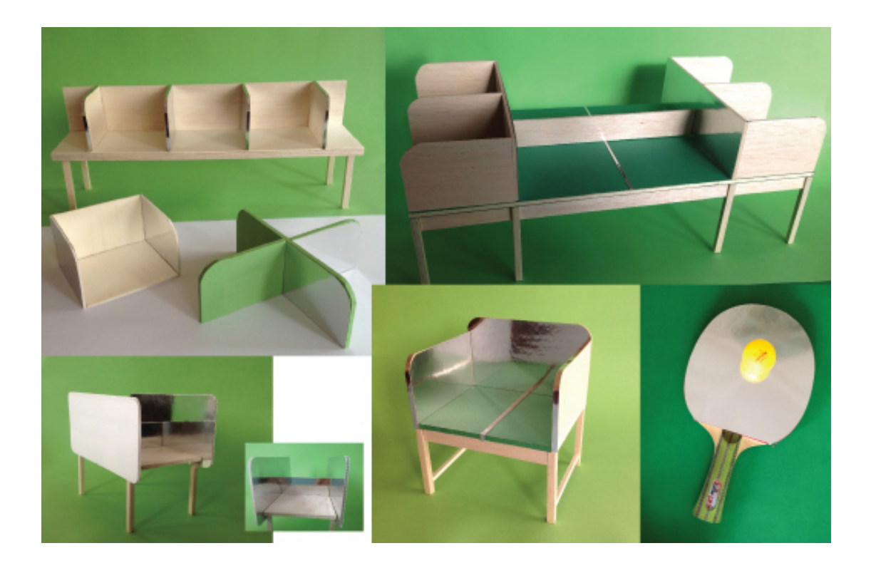
Figure 1: Studio models 2013.

structures, and objects used in physiotherapy and occupational therapy were considered in order to understand familiar forms known to encourage neurocognitive and physical engagement. For example, the library desk or carrel is partly designed in this way to give the user the space for focus and contemplation, in the same way the mirror box or polling booth does, but it also acts as a device to reduce dialogue and exchange. The work Transpositions – A Proposition for the 21<sup>st</sup> Century Library , which is a set of models and full-scale works that combine the structure of the library carrel with the spatial expansion of the mirror and include the potential to improve cognitive abilities through play and biomechanical activities. It is now well recognised that play is important in learning and that movement can aid in this process (Pound 2014, p.103). As libraries potentially move from places of quiet contemplation to include more active modes of thinking, a modified version of table tennis was included in the work as a kinaesthetic approach to learning and to boost creativity. Table tennis is often found in schools, offices and aged care facilities due to the way it is known to activate multiple regions of the brain and increase cerebral blood flow improving physical co-ordination, alertness and mood (Heller 2011, p.1).