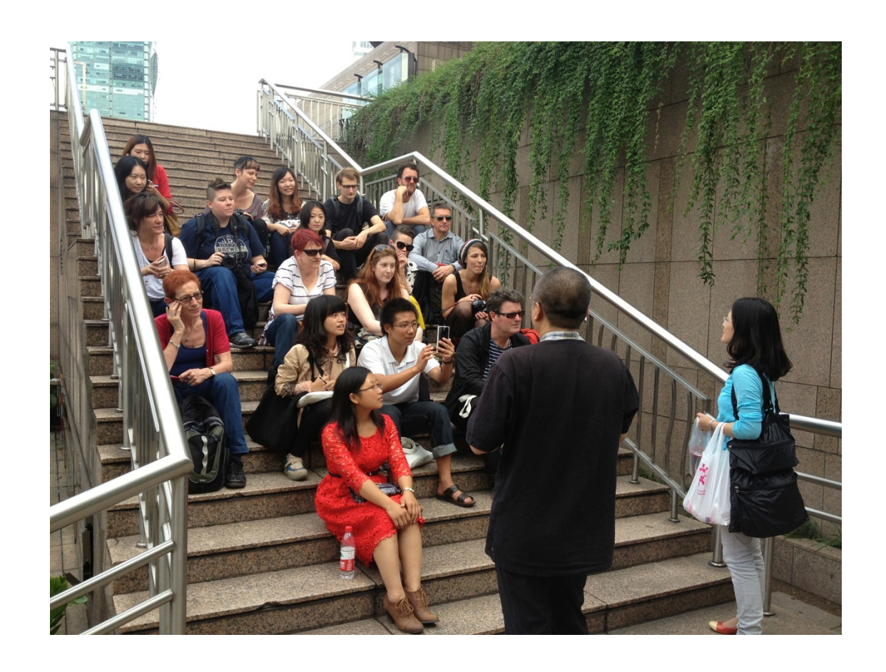
Figure 5: Professor Xu Shanxun gives a lecture to ECU staff and students and USST students during third space project in Shanghai in 2013.