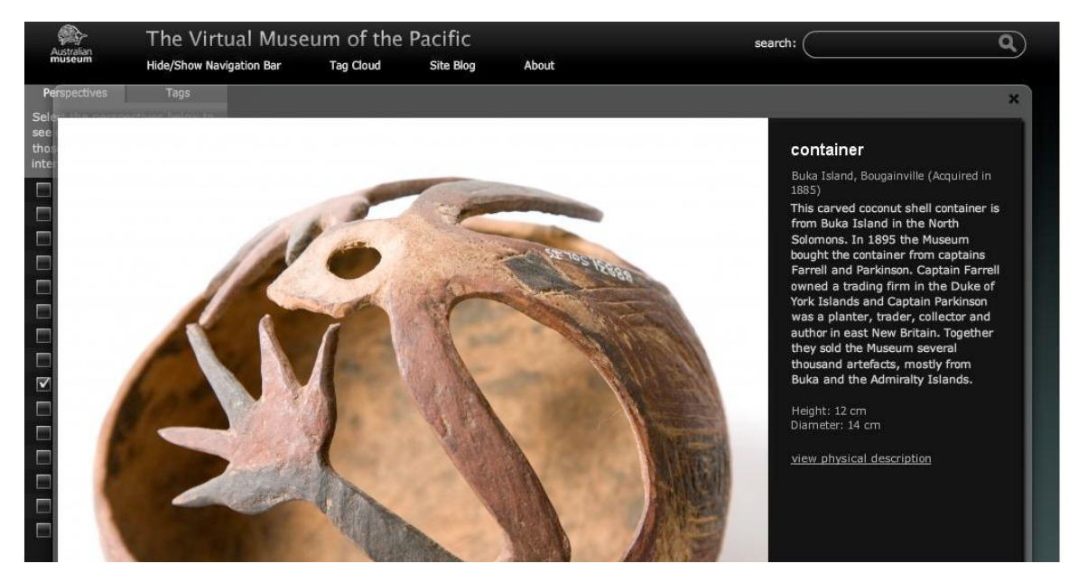
Figure 2: Object – close up view – The Virtual Museum of the Pacific - Object – close up view of container from Buka Island, Bougainville

key user community – a sample of Australian Museum staff involved in collection management, audience development and display. This has revealed an array of possibilities as well as some limitations. Several members of the Museum staff are convinced that artistic involvement in the further development of this digital collection is not only possible but highly desirable. This shift in control – from professional collection managers to artists in the role of cultural 'experts' – potentially poses a significant challenge to the hegemonic discourses that dominate traditional museum practices of collection categorisation, interpretation and display.