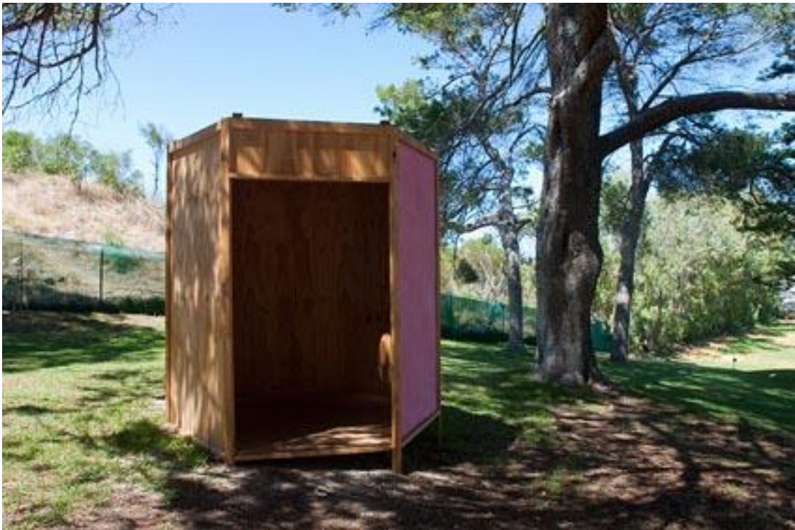
Figure 1. contemplation room dedicated to St Francis and the birds (2009) Paul Uhlmann Plywood 2.4M H x 2.4M in circumference.