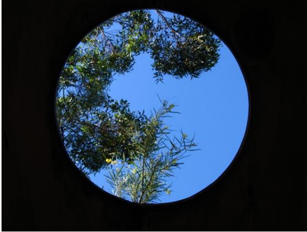
Figure 2: cupola 25th April 2011 10.28 AM, archival image from the series ' to breathe (what is it to live a life?) '