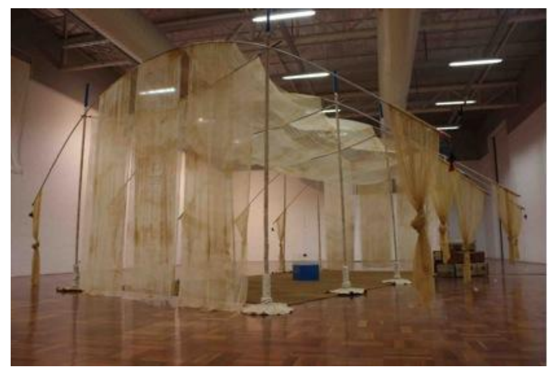
Figure 2. Restless Habitat II by FyberMotion. ANU School of Art Gallery. June 2009.

From such examples as above, students draw inspiration and motivation. These idiosyncratic works convey a great sense of potential and inclusiveness for future individual creativity. Both works feature materials common in traditional arts: wood and fabric. Both works, to some extent hide or attempt to deflect attention from the underlying technology. However, in both cases the presence of technology is explicitly stated in their descriptions and crucially, the works owe their existence to an engagement with technology that articulates a different aesthetic statement from what they would be just as static objects. This is not to say that they would not be intriguing in their own right but arguably, their narrative would depend on history rather than the future.