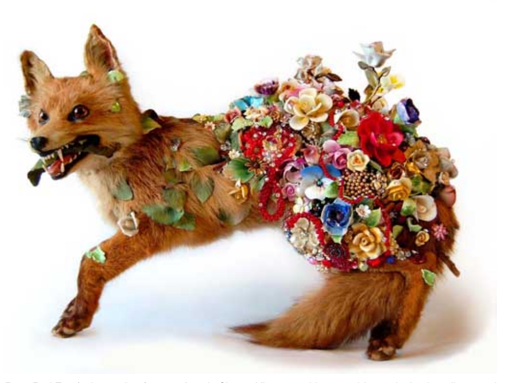
Figure 10: Hedge Row, Red Fox (vulpes vulpes), 2010, Angela Singer, Vintage taxidermy red fox and mixed media ceramic.

'It was a privilege to have the opportunity to get so close to an animal you would never normally see. To see individual details, feathers, feet so close and hear about their lives' (personal comment, June 26, 2012).