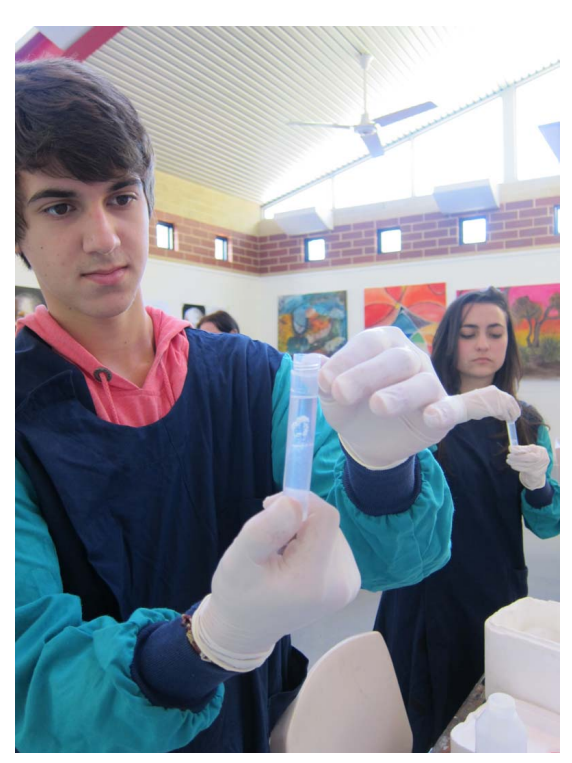
Figure 3: Students extracting DNA Biotech Evolution: Future Engagement with the Non-Human, GATE, Balcatta Senior High School, 2011.