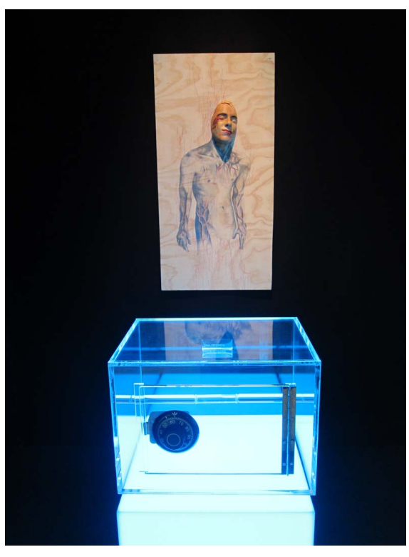
Figure 4: Keep Safe your Identity, Nicholas Lozanovski, 2012, Creatures of the Future Garden, June 21 –29, 2012, Spectrum Project Space, Edith Cowan University.