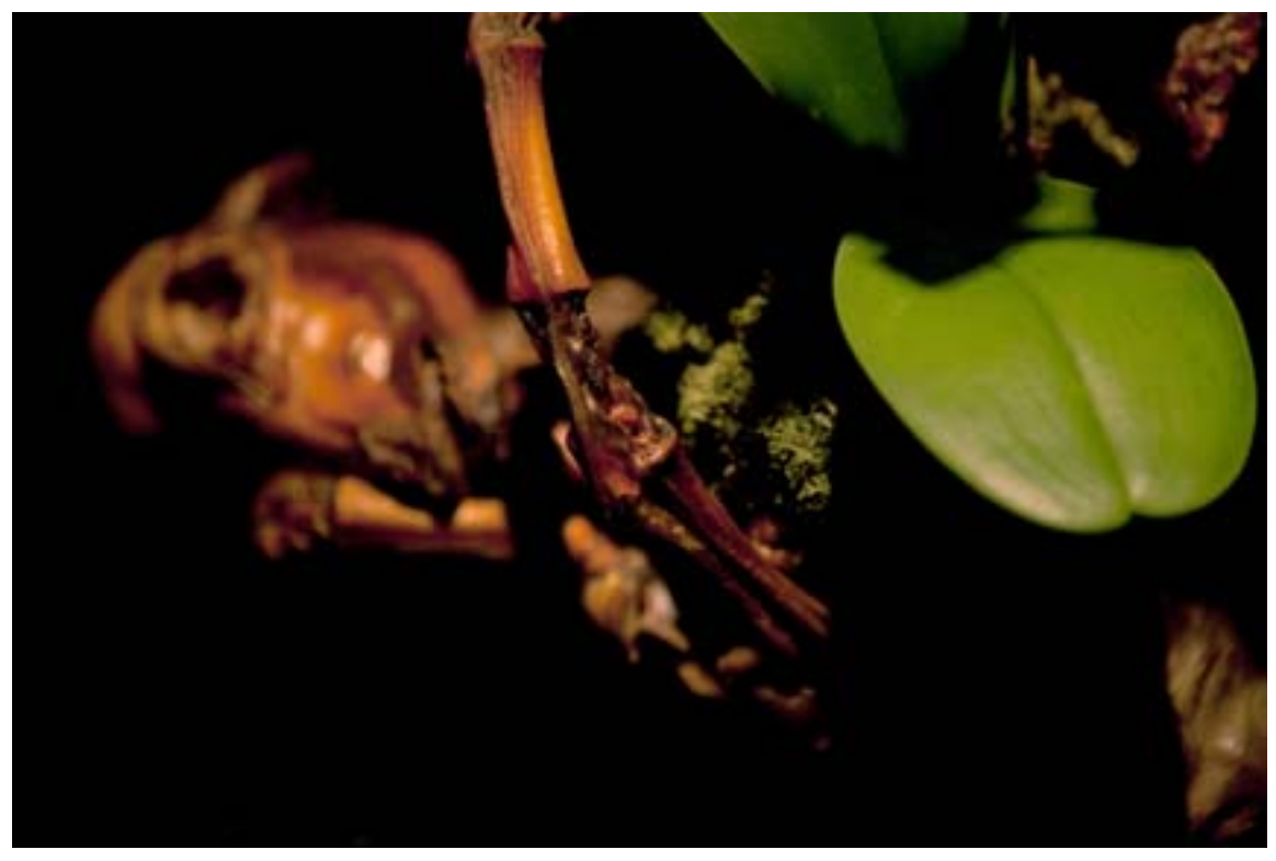
Figure 6: The Remains of Algernon and the Poetry Orchids, Svenja J. Kratz, 2011, Mummified foetal calf containing a living orchid painted with text. Creatures of the Future Garden, June 21 –29, 2012, Spectrum Project Space, Edith Cowan University.

Building on Project One, I will follow with details on the exhibiting students while also referencing viewer reactions to the artworks and the Birds of Prey workshop. I was most excited to observe the confidence that the students demonstrated when discussing their work with the public. In particular, the students demonstrated that they understood the science, and clearly articulated an awareness of the relationship between arts research and cultural communication.