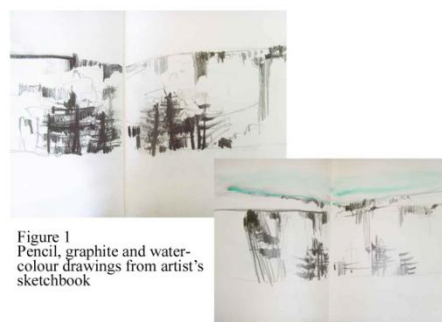
Figure 1 Pencil, graphite and water-colour drawings from artist's sketchbook

In attempting to elucidate the issues within my drawing practice, Heidegger's ontology of Being ( Sein ) (Heidegger, 1962), within the context of understanding the human kind of being, or 'Dasein' (Being-there) (Heidegger, 1962), offers a