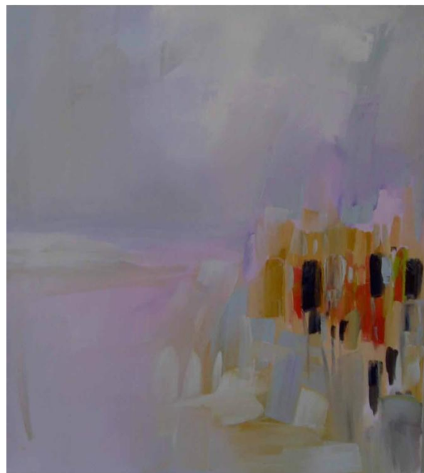
Figure 8 'Singularity'

Thus, it is possible to say that, as time passes through all 'Dasein' (Heidegger, 1962), as Being-in-the-world, the subject or being, recreates the world, or grasps it, through its temporality ( Zeitlichkeit ). In grasping, our understanding reveals that everything has meaning, and we find that this same structure of being underlies all relationships (Merleau-Ponty, 2006). Drawing, through its temporal nature, reveals and grasps subjective truth as something that '...opens up a world.' (Heidegger, 1971: 40);