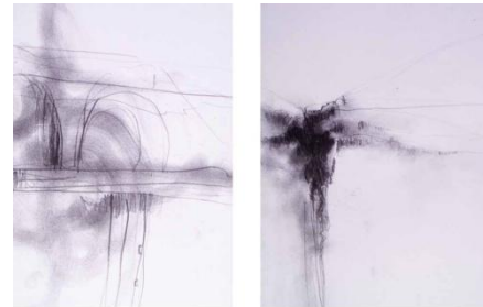
Figure 4 Graphite and charcoal drawings from artist's sketchbook

The drawings that emerged from this period mark the move towards a more explicit articulation of this specificity of 'place', in that the world is determined by the way I understand it, how I am practically involved with it. The connection between imagination and memory within a subjective experience of drawing in the landscape exists as a response to specific events and locations, through which it became possible to isolate colour as a principal form. The act of drawing within a specific