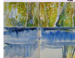
Figure 5 'Bremen' - Pencil, graphite and watercolour drawings from artist's sketchbook