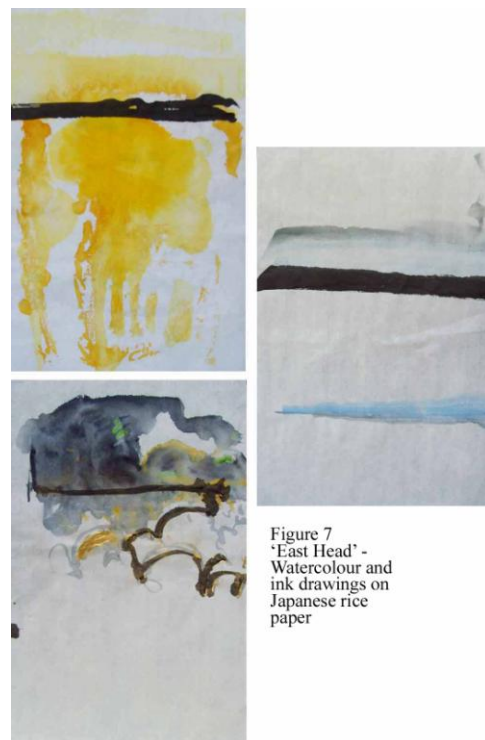
Figure 7 ‘East Head’ - Watercolour and ink drawings on Japanese rice paper

Drawing exists within a temporal flow; externally as world, movement, and internally as thought and embodied knowledge. As the temporal relationship to the landscape is suspended, it