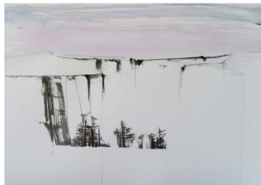
Figure 2 'Niederau' - Graphitem Charcoal, pastel and watercolour on Fabriano

The relationship between perceptual experience and the reinterpretation of an image through drawing is explored through the metaphor of 'ambiguity' ( Zweideutigkeit ) (Heidegger, 1962), or uncertainty.