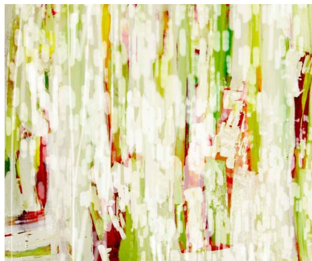
Figure 6 'Bremen 2010' - Layered digital drawing on Arches

Embodied knowledge retreats into subliminal memory, utilised as a foundation for intuition within drawing itself. Bachelard's (1884 - 1962) proposition that the mind is given form through the places and spaces in which we dwell, reinforcing this reciprocity in that, it is those places themselves, that shape and influence our memories, feelings and thoughts; '... Je suis l'espace où je suis (I am the space where I am)...' (Bachelard, 1994; 137).