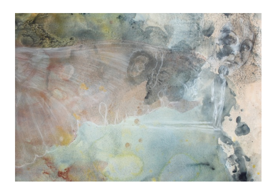
Figure 4: I can't tell you now what I could have told you then: spring 1 2012, ink and dust (charcoal, chalk) on rag paper,40 x 48cm.