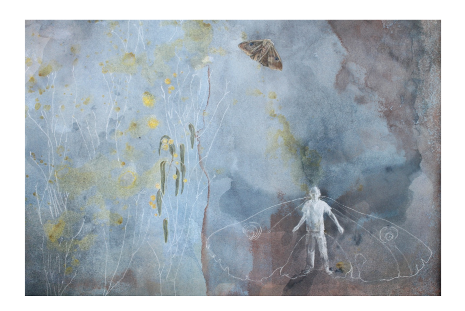
Figure 2: I can't tell you now what I could have told you then: Dasypodia Selenophora and Golden Wattle (for Elizabeth Jolley) 2012, ink and dust (chalk, pastel) on rag paper, 48 x 70 cm.