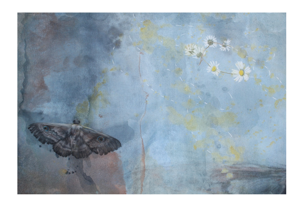
Figure 1: I can't tell you now what I could have told you then: (Garland) I remember making daisy chains 2012, ink and dust (chalk) on rag paper, 48 x 70 cm.