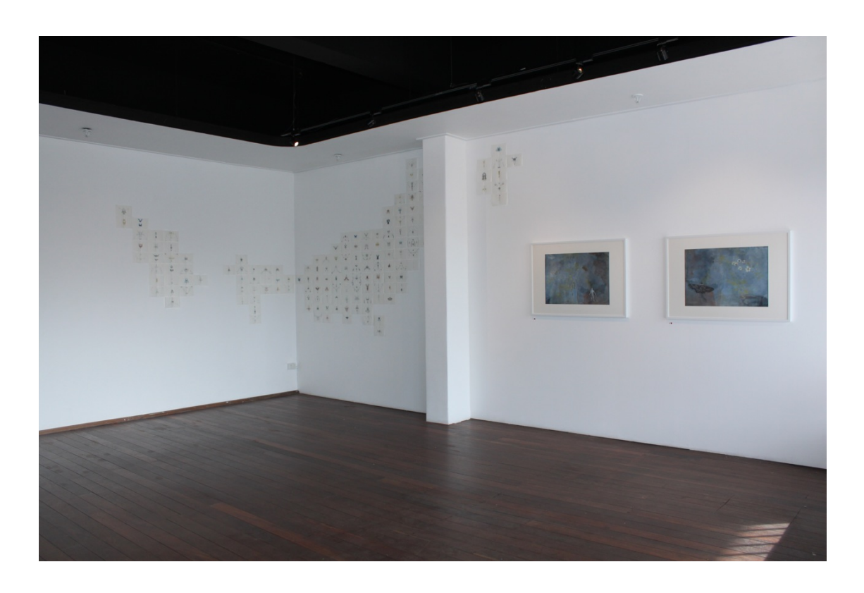
Figure 6: I can't tell you now what I could have told you then (installation view).